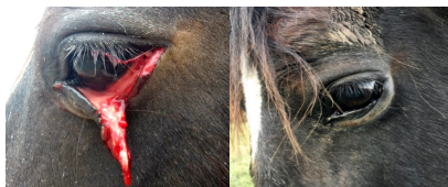
Before and after

“Fortunately, the eyelid healed well and without any complications.”